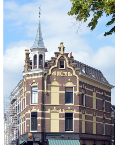
Bricked-up windows.

Not wanting to sacrifice any of the precious sunlight in her home, Corry came up with an ingenious idea: since the tax was based solely on the number of windows and not their size, she decided to install fewer but larger windows instead of many small ones. In each room, Corry had two square windows which she planned to replace by one single, square window to halve the tax. The area of this new window should equal the combined area of the two smaller ones. Given the side lengths of the two smaller windows, what is the side length of the larger window?