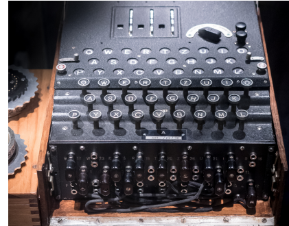
The enigma, an encryption machine that solves this problem.